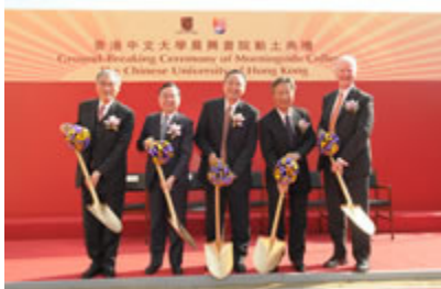
The ground-breaking ceremony of Morningside College