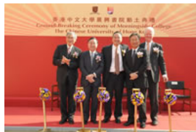
A group photo of the officiating guests