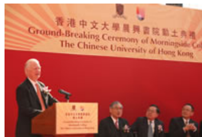
Professor Sir James Mirrlees (left), Master-Designate of Morningside College