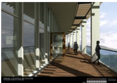
Balcony from Dining Hall