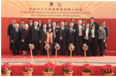
Officiating guests posing with other guests of the ceremony